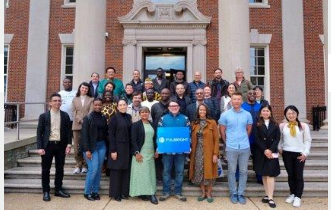
2024-2025 Fulbright S-I-Rs at Howard University