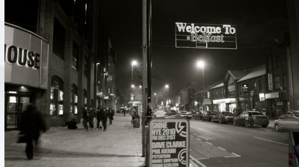
Dublin Road, Belfast, Northern Ireland