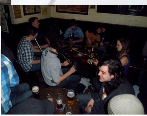
Local musicians at Kelley's Cellar