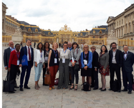
Fulbright Germany IEA Award Alums, 2016