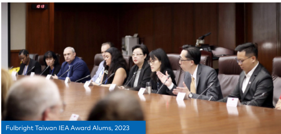
Fulbright Taiwan IEA Award Alums, 2023

▶ "My experience as a Fulbright IEA participant was outstanding. I made important gains in my professional research and networking as well as having the personal transformation of learning about a new culture."