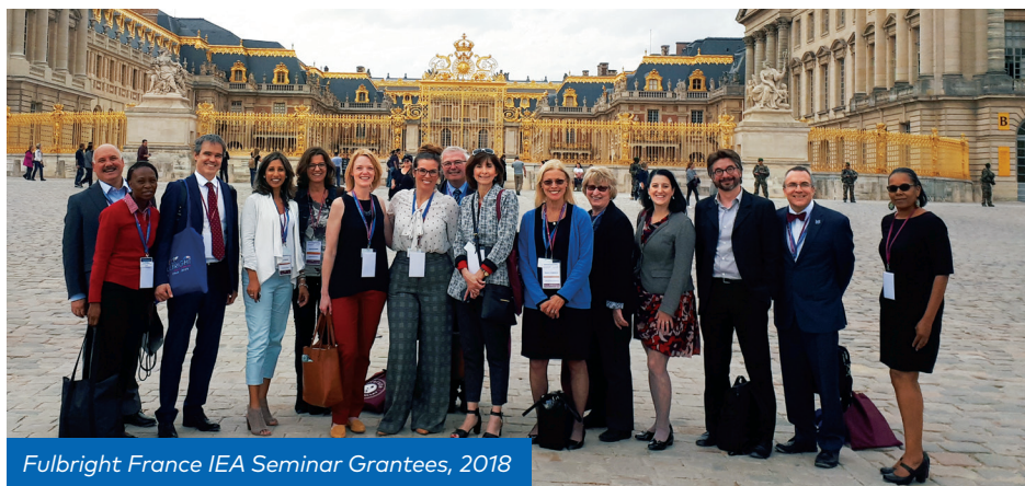
Fulbright France IEA Seminar Grantees, 2018

▶ "My experience as a Fulbright IEA grantee was outstanding. I made important gains in my professional research and networking as well as having the personal transformation of learning about a new culture."