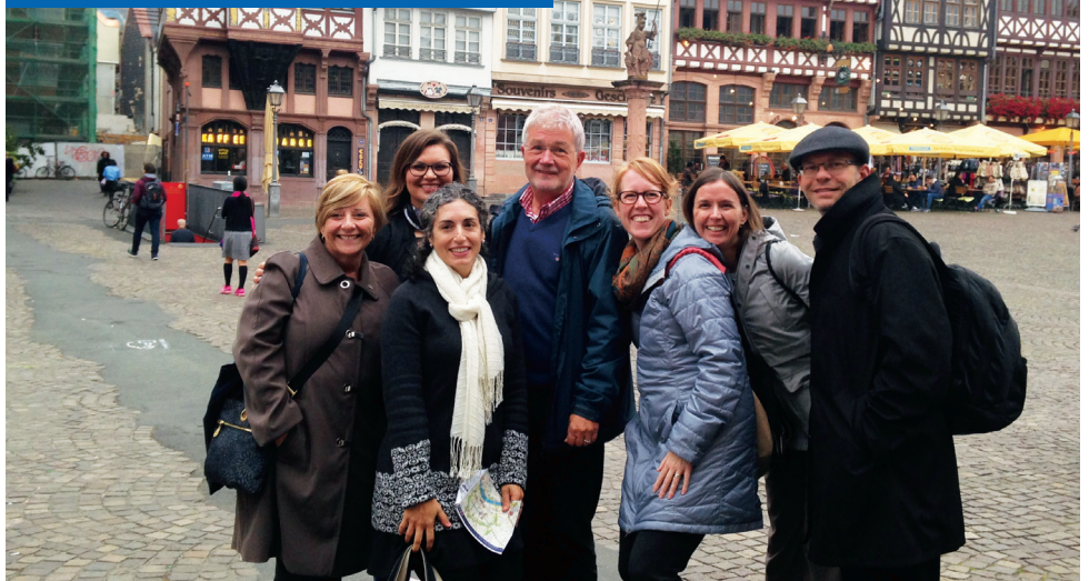
Fulbright Germany IEA Seminar Grantees, 2016

▶ "This seminar has played a transformative role for me... I am more adept at engaging and understanding cultural interactions with my Korean colleagues and students. I also now have the knowledge and enthusiasm to encourage more students to study in South Korea for their semester abroad. This has been the highlight of my career thus far, and I will encourage all of my colleagues in international education to apply for an IEA seminar."