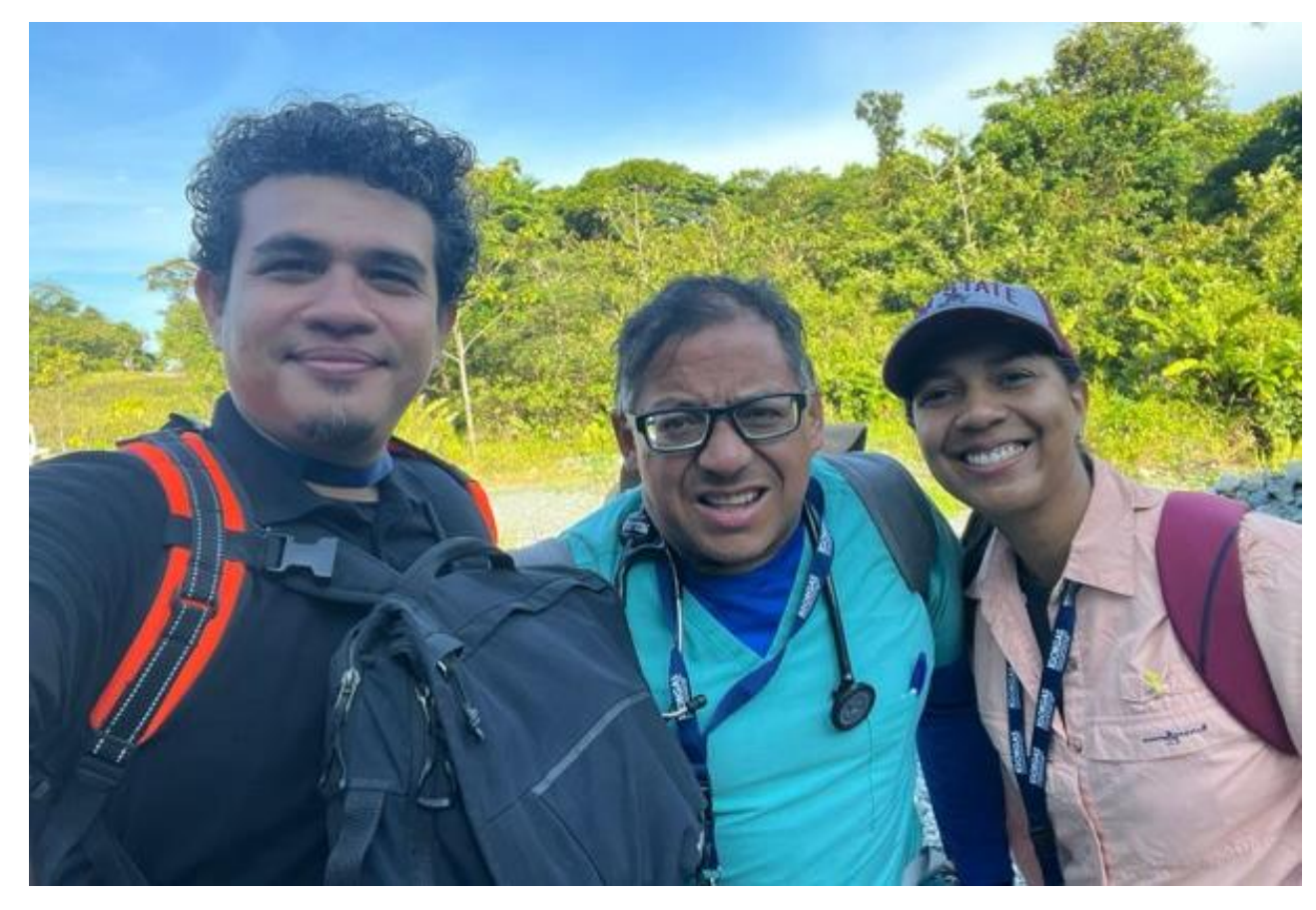
Colleagues at the Instituto Gorgas de Estudios de la Salud, Panamá