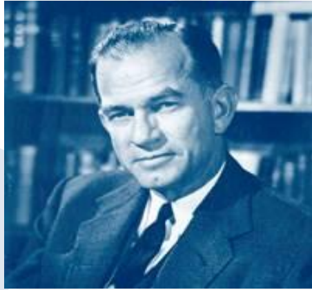
Senator J. William Fulbright (1905-1995)

“International education exchange is the most significant current project designed to continue the process of humanizing mankind to the point, we would hope, that nations can learn to live in peace.”