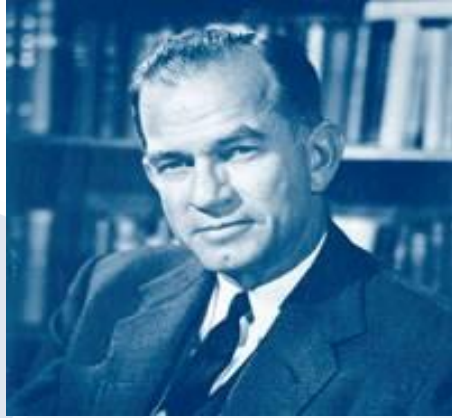
Senator J. William Fulbright (1905-1995)

“International education exchange is the most significant current project designed to continue the process of humanizing mankind to the point, we would hope, that nations can learn to live in peace.”