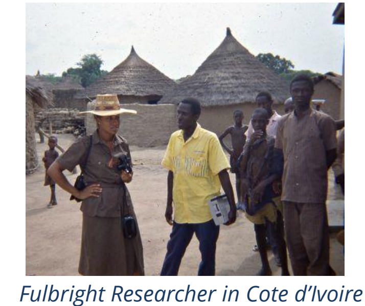
Additional awards in Benin, Cameroon, Cote d'Ivoire, Democratic Republic of the Congo, Guinea, Madagascar, Mauritius, & Senegal!