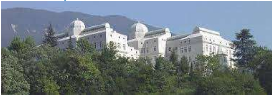
Alps in Trentino