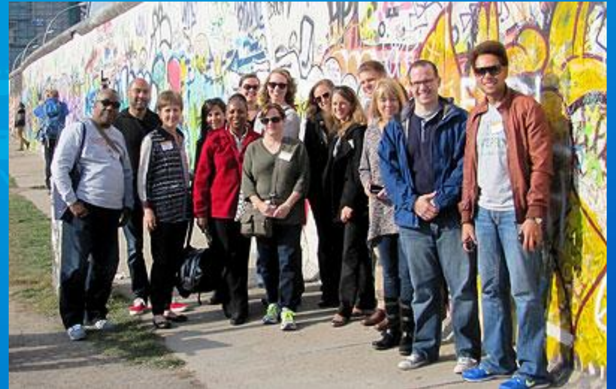
2014-2015 IEA Group to Germany