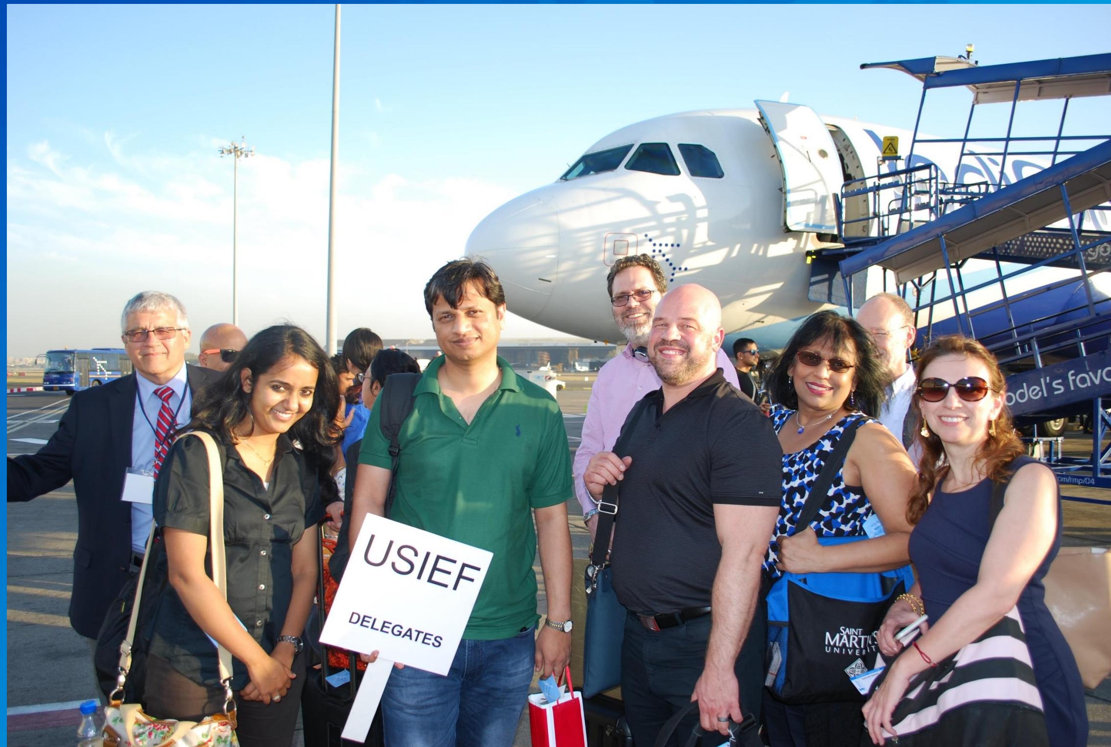
2016-2017 Fulbright IEA Seminar to India