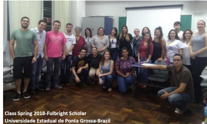
Class Spring 2018-Fulbright Scholar Universidade Estadual de Ponta Grossa-Brazil

Project Title: Socio-Emotional Well-Being of Vulnerable Youth in Rural Brazil: Examining Individual and Contextual