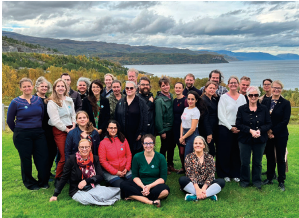
The 18-month program began with an in-person meeting in Norway (right), included a mid-term meeting in Greenland (left), and concludes in Anchorage, Alaska.

spaces. With that learning, the group recommends, among other things, sustained investment in youth-centered programs that support mental health and wellbeing.