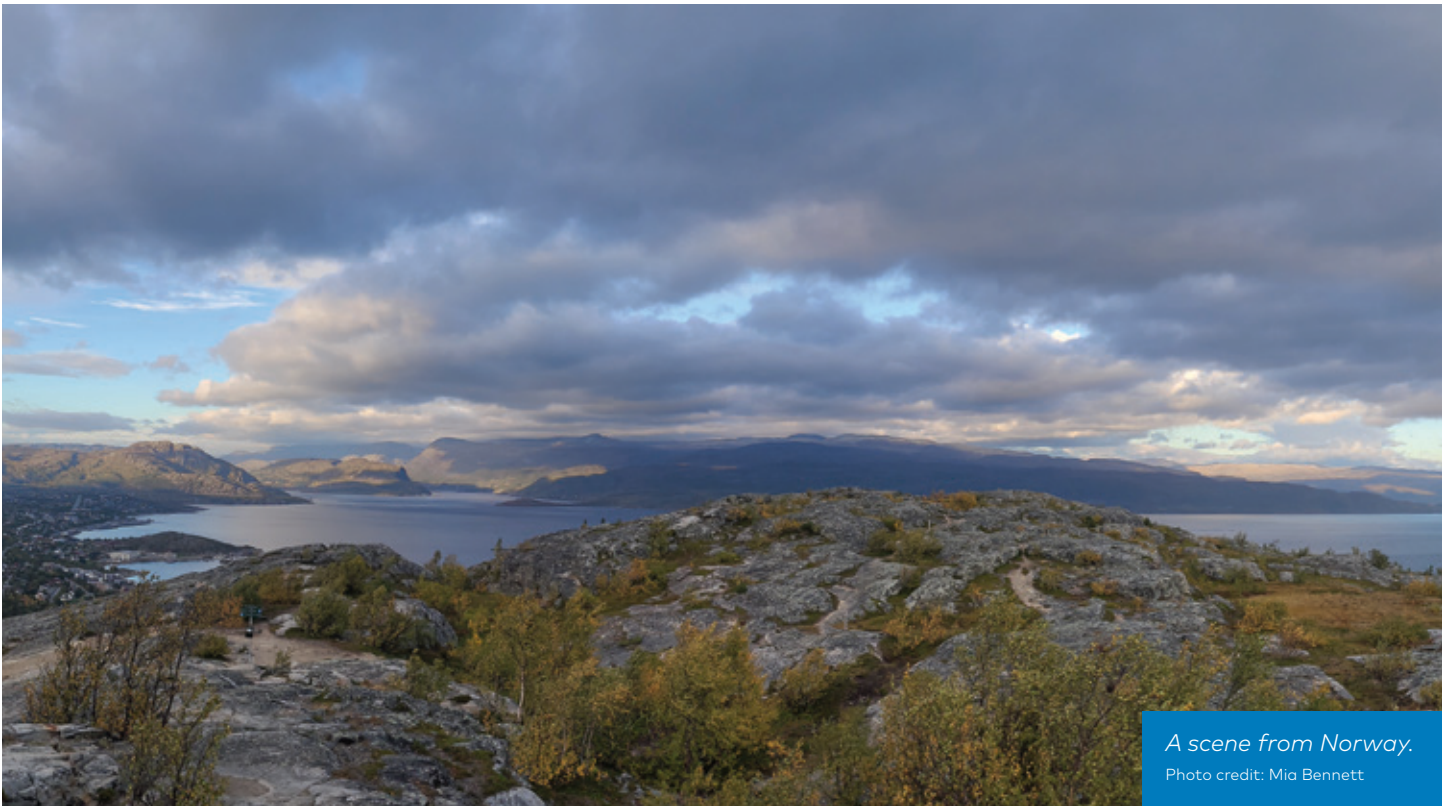
A scene from Norway.