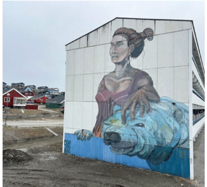
Mural as spotted in Nuuk, Greenland, in June 2025.

To address these gaps, policymakers must strengthen and formalize relationships with community-based organizations that serve and collaborate with youth. This includes establishing direct channels between these organizations and political and fiscal decision-makers, ensuring that policies reflect youth and