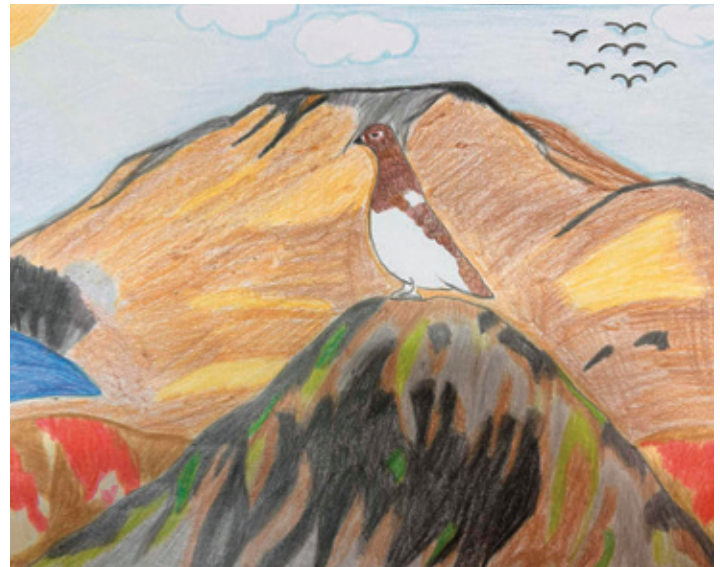
Artwork by Grace Tookoome

Policymakers often pledge to address the alarming statistics related to Arctic youth mental health and wellbeing yet still wonder, "Where are the youth?" Many of these officials fail to notice the dedicated frontline work of young people in their communities in schools, community centers, online spaces, Tribal organizations, and beyond. This oversight signals a clear disconnect between youth perspectives and the policy processes that shape their wellbeing.