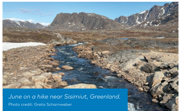
June on a hike near Sisimiut, Greenland.