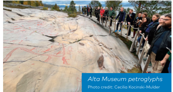
Alta Museum petroglyphs