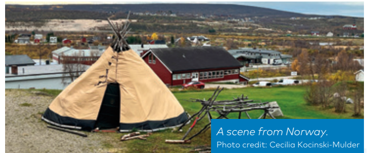
A scene from Norway.

▶ The POCI provides a practical, repeatable tool that helps agencies, partners, and decision-makers identify and reconcile differing understandings of "critical infrastructure" across state, military, municipal, local, and Indigenous perspectives.