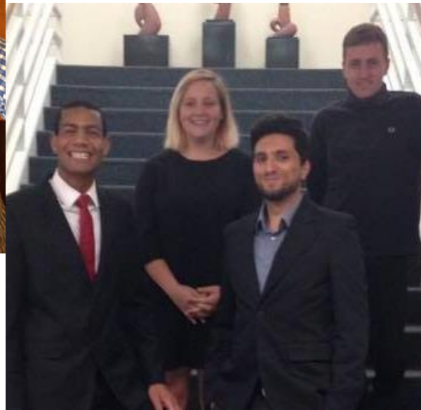
FLTAs at DCCC