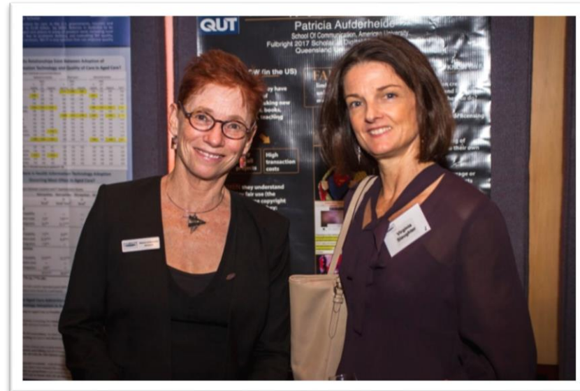
Fulbright Senior Scholar, 2016-2017

University of Technology, Sydney, New South Wales