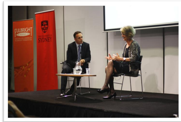
Fulbright Distinguished Chair, 2015-2016

Flinders University and Carnegie Mellon University, Adelaide, South Australia