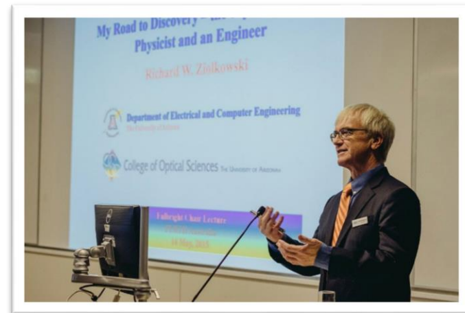
Fulbright Distinguished Chair, 2014-2015

Commonwealth Science and Industrial Research Organisation (CSIRO)