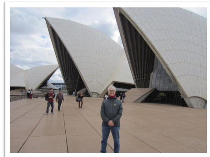
Fulbright Distinguished Chair, 2014-2015

May be conducted at any appropriate institution