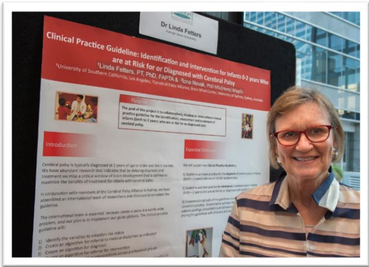
Fulbright Senior Scholar, 2015-2016

University of Canberra, Australian Capital Territory