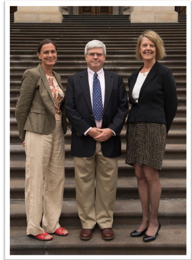
Fulbright Distinguished Chairs, 2015-2016

The University of Newcastle, New South Wales