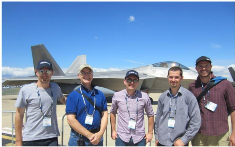
Fulbright Distinguished Chair, 2014-2015